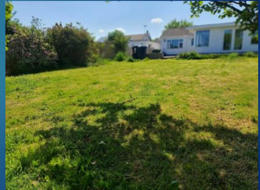
Rear of house