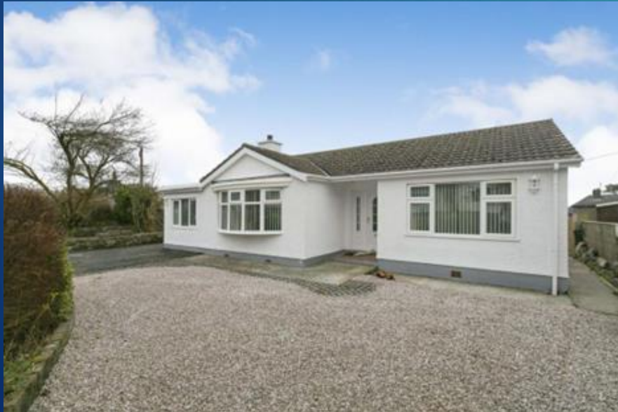
Front of house